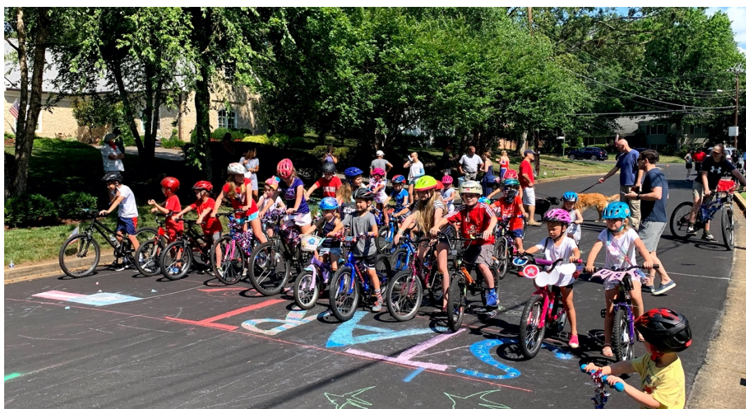
Villamay kids line up their bicycles for the neighborhood's annual Independence Day Parade on Admiral Drive.